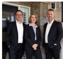
The Sales Team 03 5755 1307

Price : $980,000 Land Size : 927 sqm View : https://www.dickensrealestate.com.au/sale/vic/north-eastern/bright/residential/house/7955177