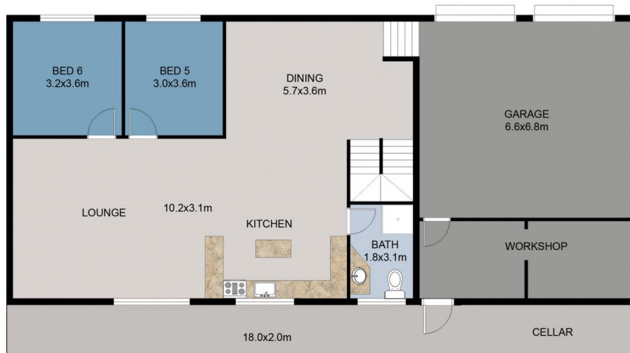
LOWER LEVEL PLAN