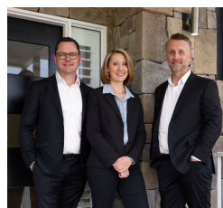
The Sales Team 03 5755 1307

Price : $4,250,000 Land Size : 7.577 ha View : https://www.dickensrealestate.com.au/sale/vic/north-eastern/wandiligong/residential/rural/7846624