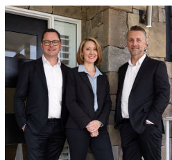
The Sales Team 03 5755 1307

View : https://www.dickensrealestate.com.au/sale/vic/north-eastern/bright/residential/townhouse/7808188