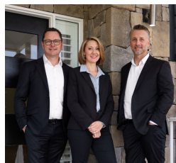
The Sales Team 03 5755 1307

Price : $945,000 Land Size : 1500 sqm View : https://www.dickensrealestate.com.au/sale/vic/north-eastern/wandiligong/residential/home/7751869