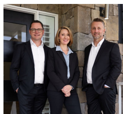
The Sales Team 03 5755 1307

Price : $875,000 Building Size : 21 sqm Land Size : 658 sqm View : https://www.dickensrealestate.com.au/sale/vic/north-eastern/bright/residential/house/7725351