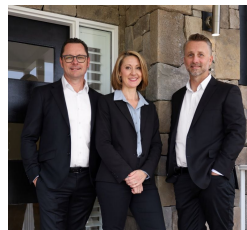
The Sales Team 03 5755 1307

View : https://www.dickensrealestate.com.au/sale/vic/north-eastern/bright/residential/house/7718803