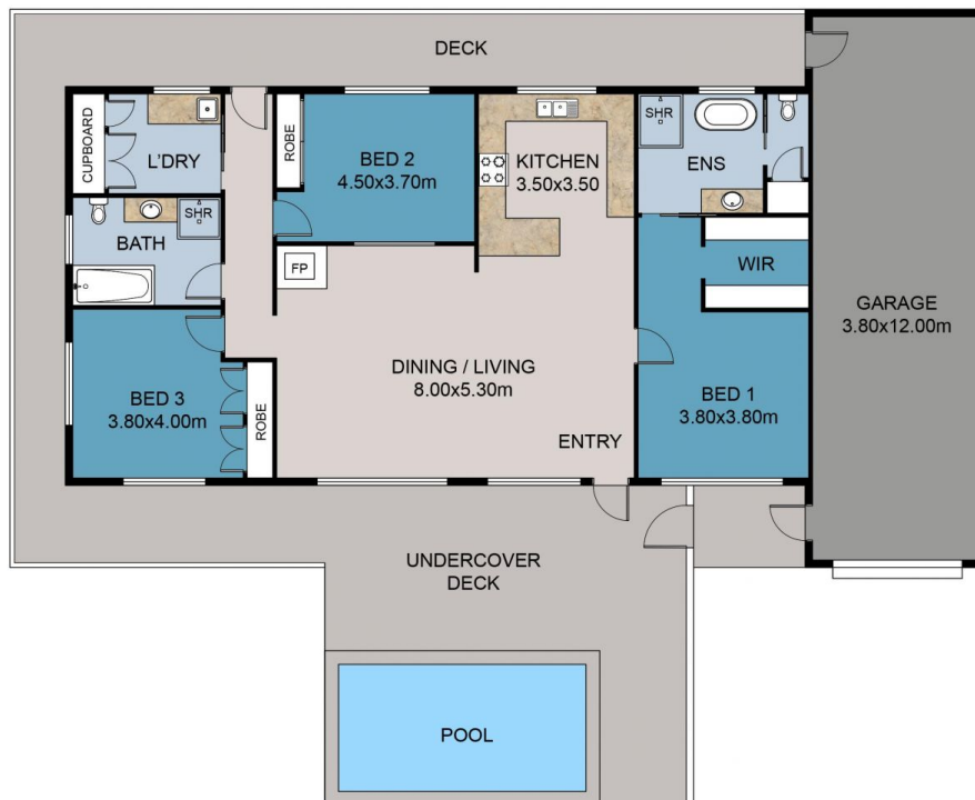
F L O O R P L A N

This floor plan including furniture, fixture measurements and dimensions are approximate and for illustrative purposes only. BoxBrownie.com gives no guarantee, warranty or representation as to the accuracy and layout. All enquiries must be directed to the agent, vendor or party representing this floor plan.