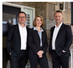
The Sales Team 03 5755 1307

Price : $949,000 Land Size : 272 sqm View : https://www.dickensrealestate.com.au/sale/vic/north-eastern/bright/residential/townhouse/7667378