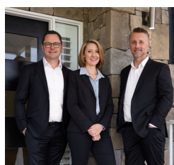
The Sales Team 03 5755 1307

View : https://www.dickensrealestate.com.au/sale/vic/north-eastern/bright/residential/unit/7483451