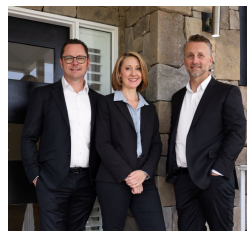
The Sales Team 03 5755 1307

Price : $1,295,000 Building Size : 210 sqm Land Size : 2030 sqm View : https://www.dickensrealestate.com.au/sale/vic/north-eastern/bright/residential/house/7423334