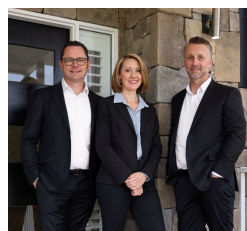
The Sales Team 03 5755 1307

Price : $1,295,000 Building Size : 210 sqm Land Size : 2030 sqm View : https://www.dickensrealestate.com.au/sale/vic/north-eastern/bright/residential/house/7423334