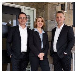
The Sales Team 03 5755 1307

View : https://www.dickensrealestate.com.au/sale/vic/north-eastern/bright/residential/house/7109387