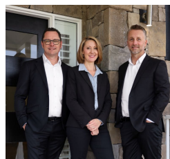
The Sales Team 03 5755 1307

View : https://www.dickensrealestate.com.au/sale/vic/north-eastern/bright/residential/house/6929800