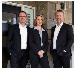
The Sales Team 03 5755 1307

View : https://www.dickensrealestate.com.au/sale/vic/north-eastern/bright/residential/unit/6905742