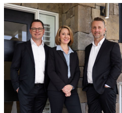
The Sales Team 03 5755 1307

View : https://www.dickensrealestate.com.au/sale/vic/north-eastern/bright/residential/unit/6905742